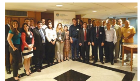
Rio de Janeiro, Brazil